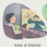
saw a movie