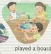
played a board game