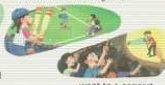
went to a concert